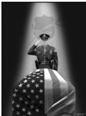
"End of Watch" by Marc Wolfe ( marcwolfeart.com ) available in full color / Used by Permission

Lord, thank YOU for being the rock and strength for these families in their loss. Father God, be a father (or mother) to their children and a close comforter to the ones left behind. Lord, bring YOUR comfort, peace and provision to these precious families, and I ask that YOU continue to stay close to them with YOUR peace, healing and security now and forever.